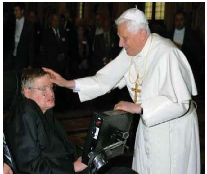
Pope Benedict XVI blessing world renowned Professor Stephen Hawking, in October, 2008 at a conference on faith and science.